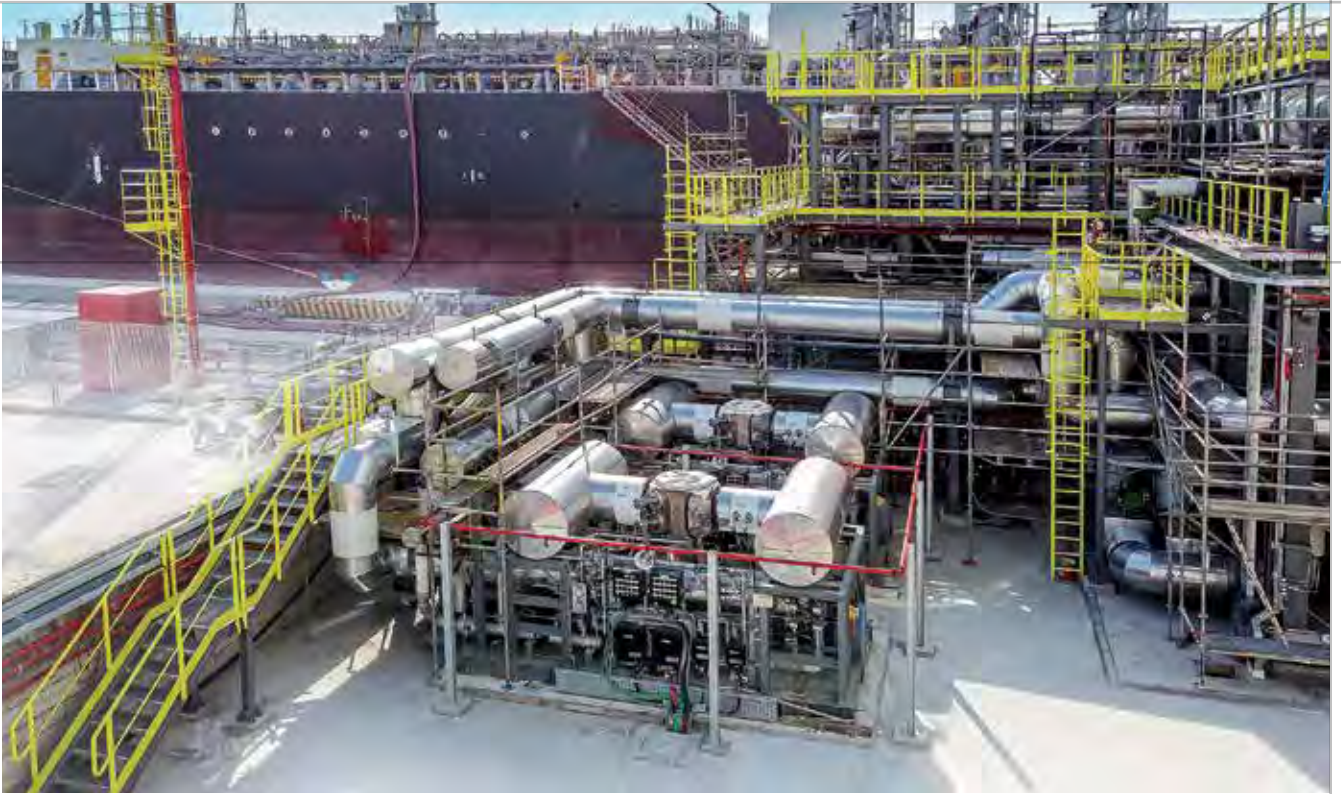
BOG compressors